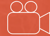
Data Projector & Video Projector